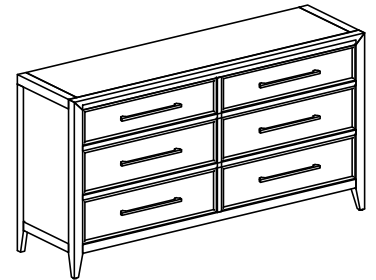
51860 6-Drawer Dresser

Important Use Information: We recommend using coasters, placemats and trivets when placing hot or cold containers on this item. It is also recommended to quickly cleanup any spills to minimize exposure to moisture. Doing so will prolong the life and look of the item for many years.